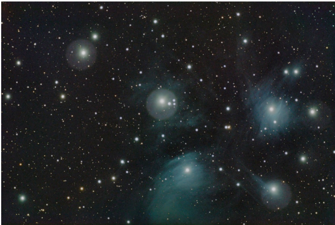
Figure 4: Test shot of M45 taken with the ES 127ED and a QHY8Pro, a Starlight Xpress Lodestar, a Losmandy G11, a Mini Borg guidescope, PHD Guiding, and Nebulosity.

Since time was short and the skies were bright (these are under fairly urban skies), I stuck to brighter targets. The first night out was M42 using my QSI 540 wsg and Baader LRGB filters (Figure 3). The scope performed very well and had I taken the trouble to refocus between filters, the shot would have been even nicer. Stars in one corner began to get a bit distorted (I believe owing to a touch of flex with the heavy camera), but overall it did a superb job. There was a touch of CA around the brighter stars but this could be removed by shifting the overall focus slightly, by refocusing a touch for the blue filter, or by post-processing. Flats showed that the corner of my 15 x 15 mm sensor was over 90% illuminated.