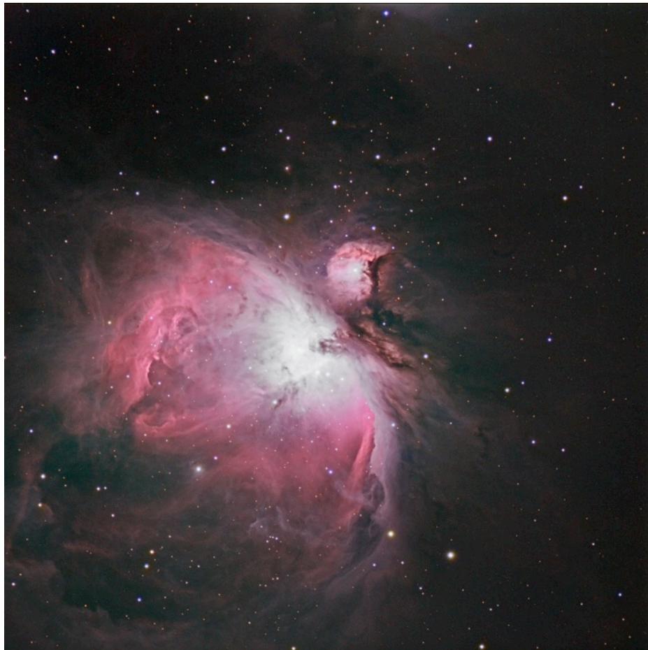
Figure 3: Test shot of M42 taken with the ES127 ED and a QSI 540 wsg camera using Baader LRGB filters, a Starlight Xpress Lodestar, a Losmandy G11, PHD Guiding, and Nebulosity

In short, it's a great scope. No 5" scope is going to let my naked eye resolve M51's arms from my urban yard. What 5" can do, the scope does very well. There are no annoying glares or flares from the moon or neighbor's lights. Contrast is excellent and stars are tight and round with no errors that draw your attention. The moon is a joy to cruise at any magnitude my skies could support. The scope mechanically and optically disappeared and I could focus on whatever I wanted to observe.